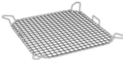
Deep Fry Basket